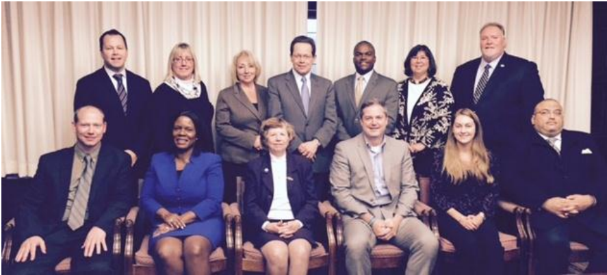
CT Student Success Center Advisory Board, November 2015