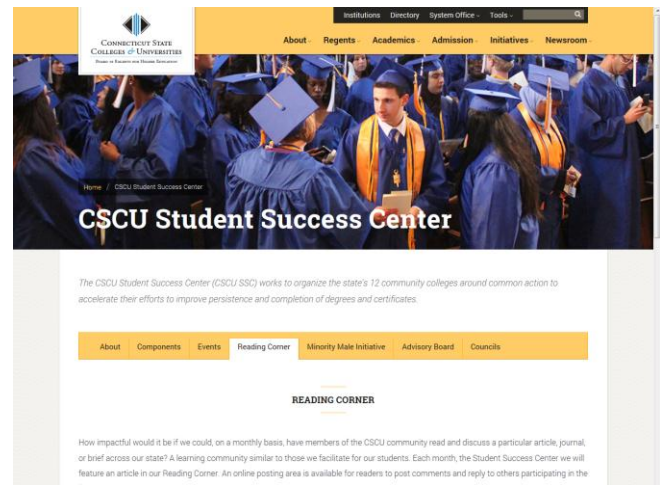
Screen shot of the CT Student Success Center Webpage