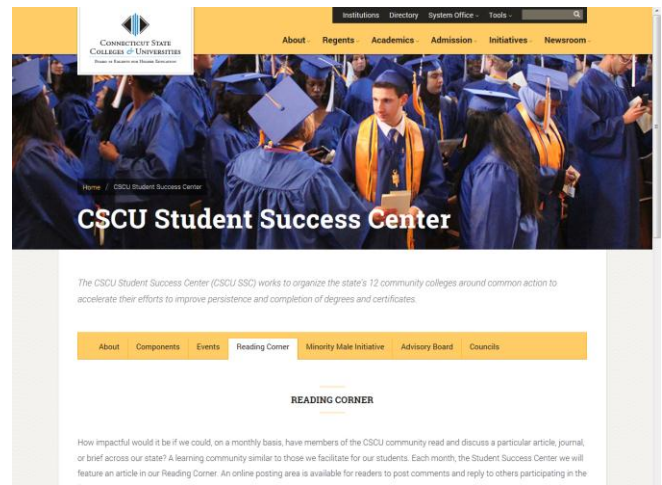
Screen shot of the CT Student Success Center Webpage